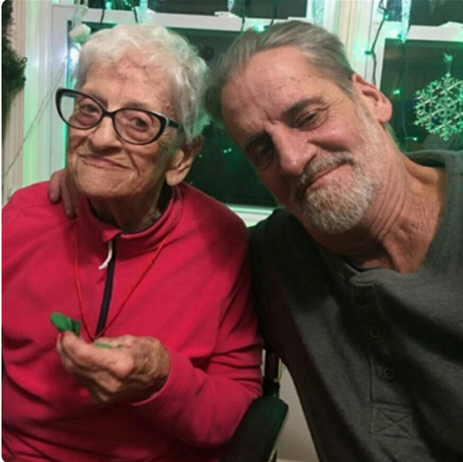
Christmas Eve 2017